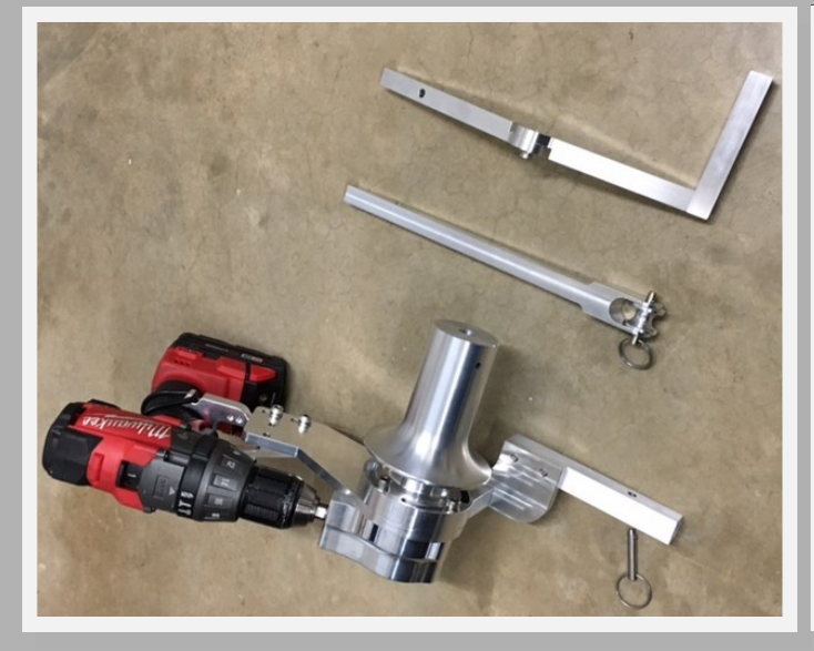
Attachments easily break down for storage in a tool box or bag.

The CP1000 measures only 24" long when fully extended. When collapsed it easily fits into a tool bag. The heavy-duty drill chuck and handle lock attachment provide a sturdy base of operation. Wires up to 1/0 gauge can be pulled using the device.