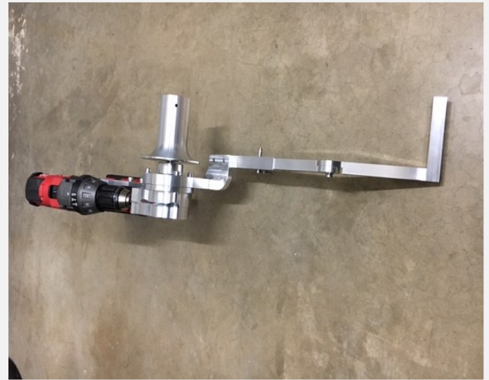
Puller handle is designed for ergonomic convenience and tool control.